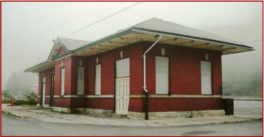
Mannington Depot in the mist