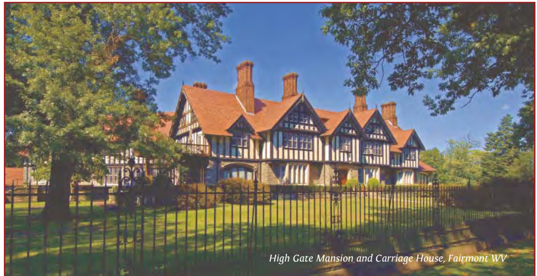
High Gate Mansion and Carriage House, Fairmont WV